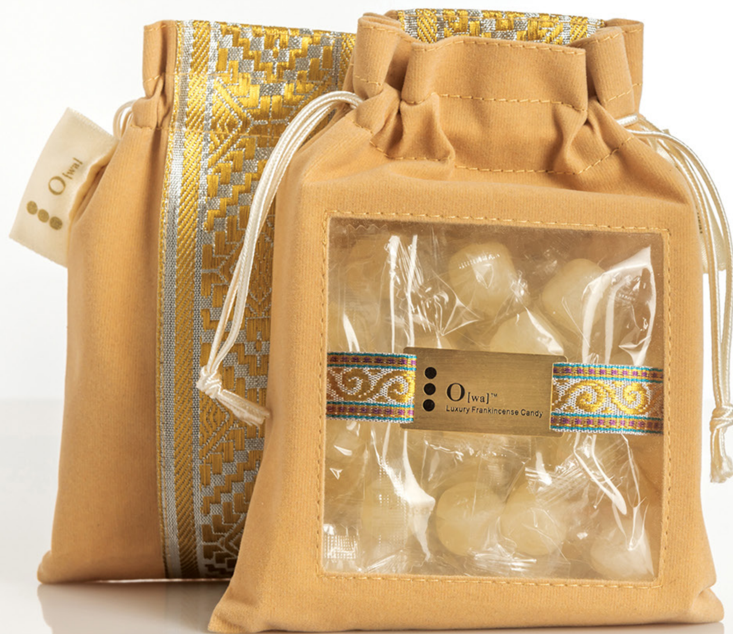
Omani Handcraft Pouch