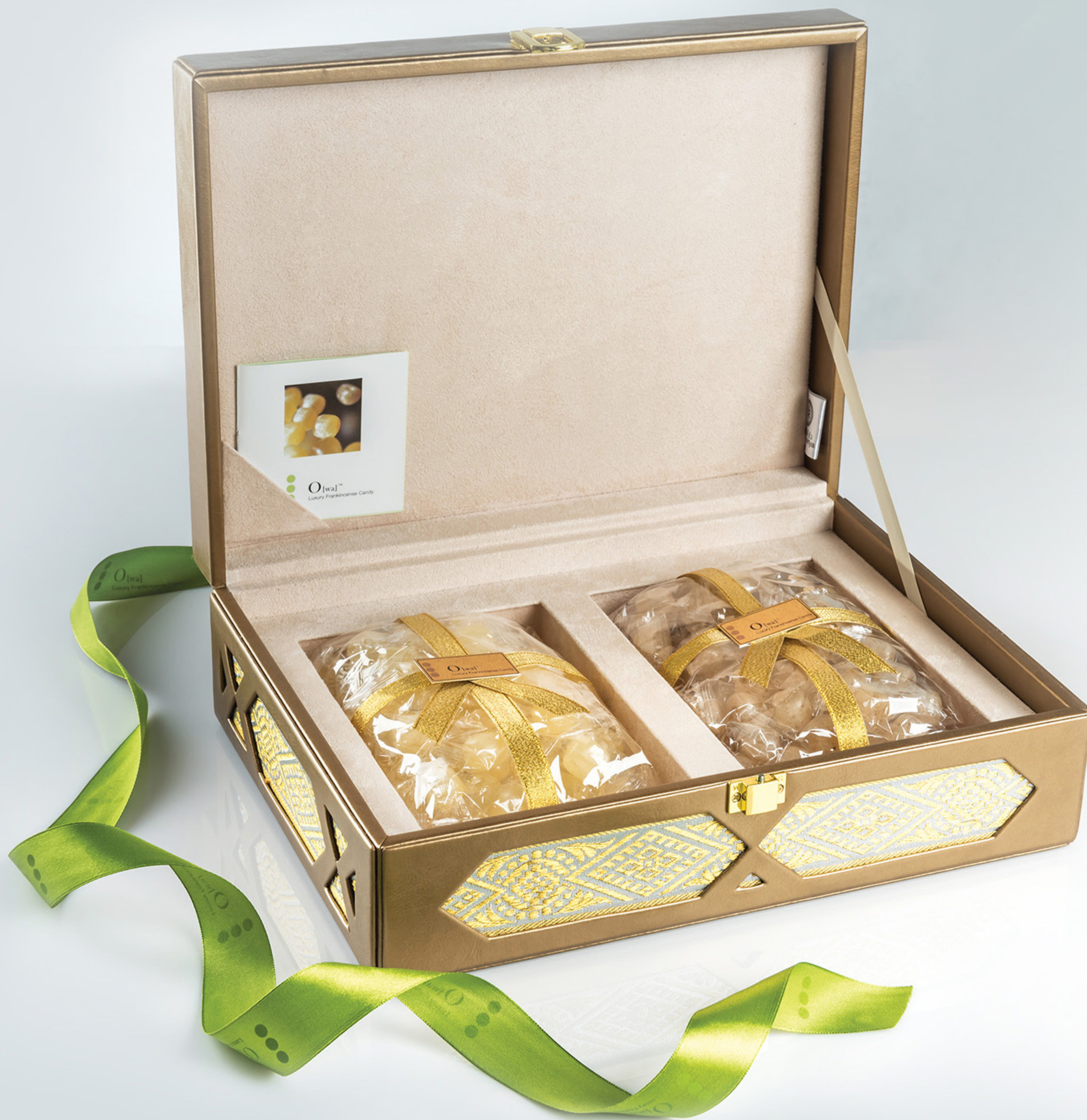
Omani Handcraft VIP Box