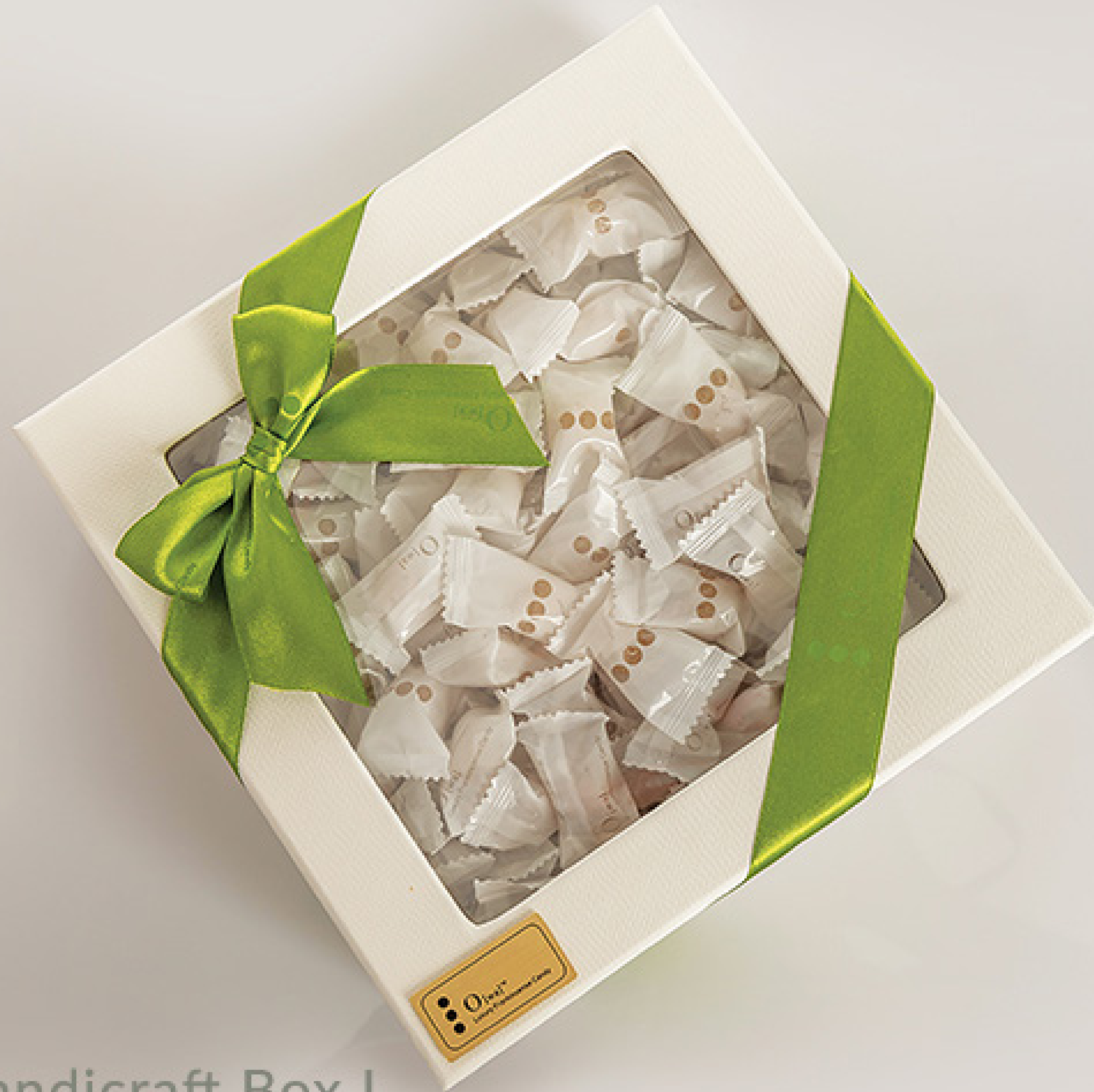
Omani Handicraft Box L

O [wa] traditional line packaging is sourced from Dar alHerfya which promotes traditional Omani handicrafts by working with skilled local craftsmen. The initiative supports more than 300 families around Oman.