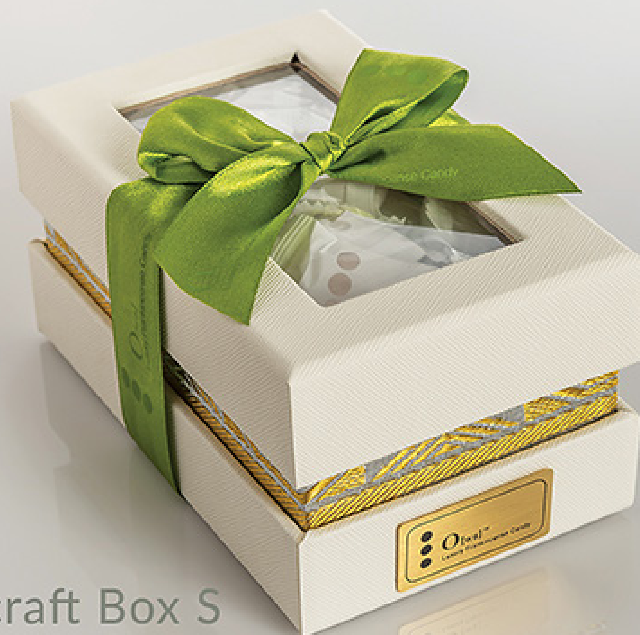
Omani Handcraft Box S